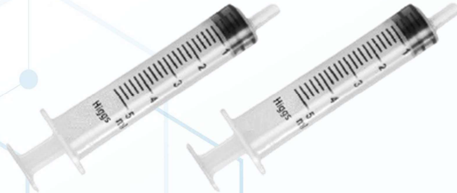
3part Disposable Syringes (Luer Mount/slip)