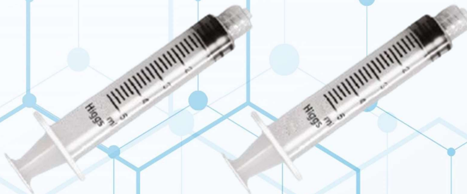
3 Part Disposable Syringes ( Luer Lock)